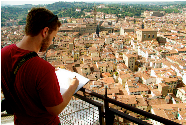
UC student, Florence, Italy.

Find unique courses in film studies in the following countries: Argentina -Australia – Barbados - Brazil – Chile – China - France - Germany - Hong Kong - India – Ireland - Italy - Korea - Mexico - South Africa – Singapore - Spain – Sweden